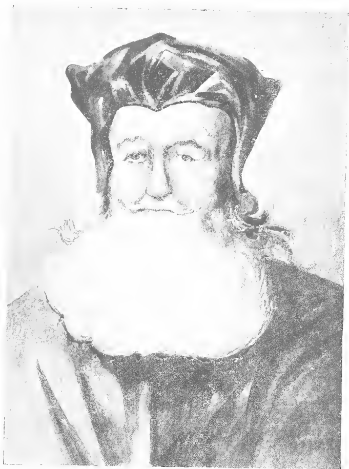
The Merry Vicar of Meudon.